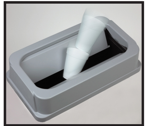
Shown in use