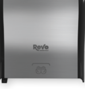
Revo Electronic Hands-Free Towel Dispenser, Stainless

Having the right skincare program plus using the hands-free Revo Controlled Dispensing System can help build the right hygiene solution for any environment.