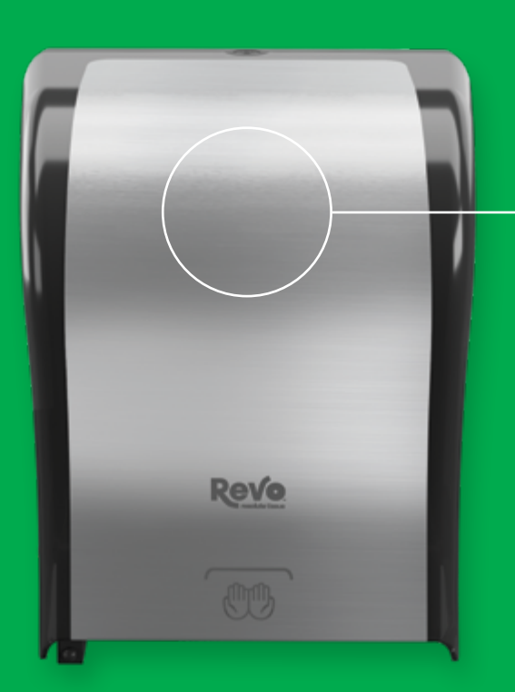
Standard Dispenser Colors